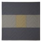
3. Cinema Art, River Street, Troy, NY, March 27, 2015 , wool, pieced and hand quilted, 34 x 34, 2016.