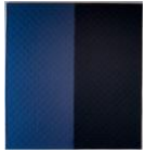
1. Chicago O'Hare Airport, July 31, 2014 , wool, pieced and hand quilted, 97 x 90", 2015.