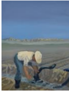
3. Flume , oil on canvas, 30 x 24”, 2021. $1,500