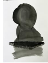
15. Camp #9 , ink on paper, 20 x 15", 2018. $950