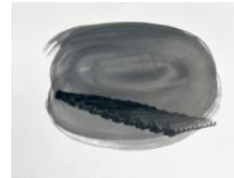
18. Camp #7 , ink on paper, 15 x 20", 2018. $950