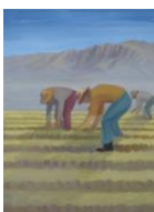
6. Reach , oil on canvas, 30 x 24”, 2021. $1,500