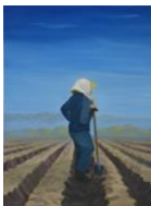
4. Promise , oil on canvas, 30 x 24”, 2021. $1,500