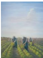
5. Groundwork #5 , oil on canvas, 60 x 48”, 2014. $3,500