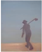
1. Shoulder , oil on canvas, 30 x 24”, 2021. $1,500