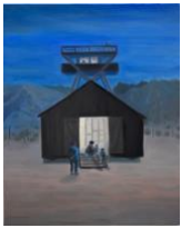
13. No Home , oil on canvas, 30 x 24", 2021. $1,500