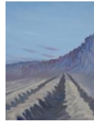
8. Trench , oil on canvas, 30 x 24”, 2021. $1,500