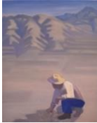
2. Plotting , oil on canvas, 30 x 24”, 2021. $1,500