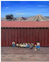
● 14. Lesson , oil on canvas, 30 x 24", 2021. $1,500