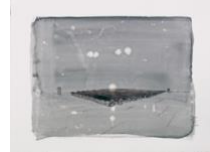
● 16. Camp #8 , ink on paper, 15 x 20", 2018. $950