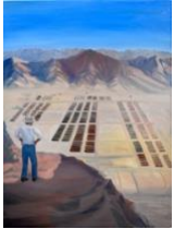
12. Lookout , oil on canvas, 48 x 36", 2021. $3,000