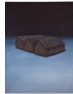
17. Poston Study #1 , oil on canvas, 30 x 24", 2019. $1,500