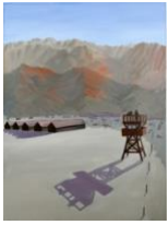
11. Scrutiny , oil on canvas, 48 x 36", 2021. $3,000