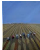
7. Race , oil on canvas, 30 x 24”, 2021. $1,500