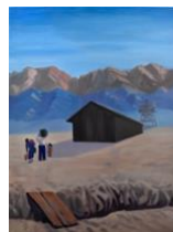
10. Plank , oil on canvas, 48 x 36”, 2021. $3,000