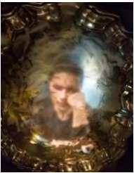
2. The Form of Extinction is not Inelegant , Steve Erra, image 24"x16", frame 30 3 / 4 " H X 21 3 / 4 " W, $350 framed / $175 unframed.