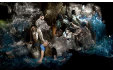
4. The Raft , Mark Andres and SWPC, 30 3 / 4 "H x 39 3 / 4 "W, $400 framed / $200 unframed.