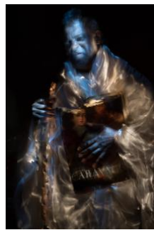
21. Caravaggio , John Gardiner and SWPC, image 16"x 24", frame 21 3 / 4 " W X 30 3 / 4 " H, $350 framed / $175 unframed.