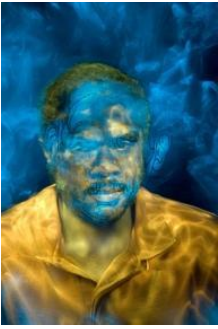
17. Reflexology , Donald Martinez, image 24"x16", frame 30 3 / 4 " H X 21 3 / 4 " W, $350 framed / $175 unframed.