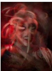
16. Medusa , Constance McMillan, 17" H x 13" W $200 framed / $100 unframed)