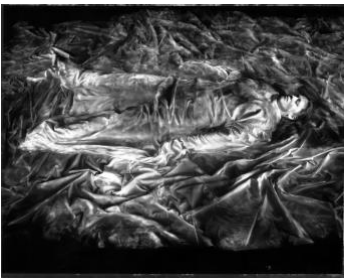
25. Entrapped , Stephan Dominguez, image 17”H x 21”W, $300 framed / $150 unframed 16”W x 20”H.

COURTHOUSE GALLERY • 1 Amherst Street • Lake George • NY • 12845 • (518) 668-2616 mail@lakegeorgearts.org • www.lakegeorgearts.org