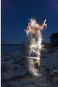
12. Untitled (Sweden) , Steve Erra, image 24"x16", frame 30 3 / 4 " H X 21 3 / 4 " W, $350 framed / $175 unframed.