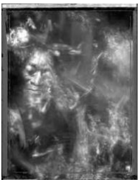
9. In Water , Benjamin Paige With Mark Andres, 21”H x 17”W, $300 framed / $150 unframed.