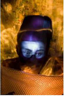
18. Untitled , Donald Martinez, image 24"x16", frame 30 3 / 4 " H X 21 3 / 4 " W, $350 framed / $175 unframed.