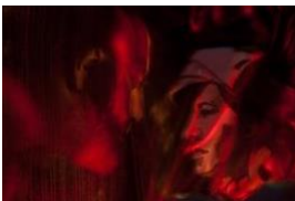
15. Untitled Self portrait , Phil Malek, image 16"x 24", frame 21 3 / 4 " W X 30 3 / 4 " H, $350 framed / $175 unframed.