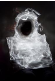
3. Radiant Abyss (color) , Victorine Floyd Fludd, image 24"x16", frame 30 3 / 4 " H X 21 3 / 4 " W, $350 framed / $175 unframed.